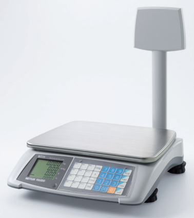
bRite Weigh Only