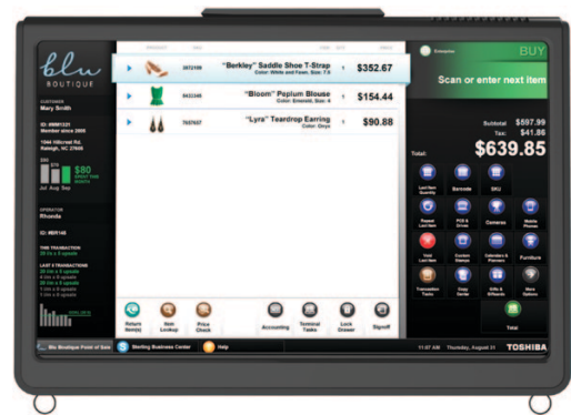
■ Shown: Mobile unit with no base and integrated MSR (front)

The TCxFlight enables traditional or mobile solutions for today's retailers with the power and performance packaged in a rugged design. All of the logic is contained in the mobile unit.