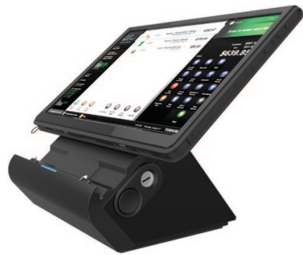
■ Shown: TCxFlight Separation

Mobile devices are of limited value unless they are available when required. Too often, this is not the case with single purpose mobile devices that are locked away when not in use. TCxFlight is reconfigurable on demand with the simple push of a button. Shown below, the mobile unit can be locked and docked with an optional base unit. Used in this way, the mobile unit can be secured right where it is used in any number of primary traditional roles.