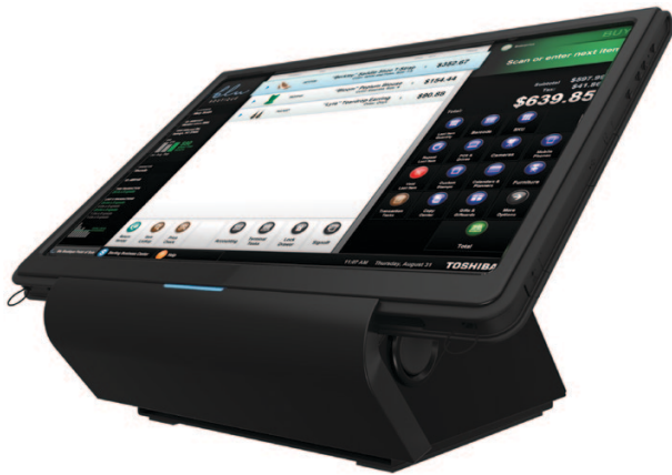
■ Shown: TCxFlight Point of Commerce Solution with Base Feature

Toshiba TCxFlight is a traditional solution to today's core retail requirements. With its elegant design, TCxFlight offers an extension of the Toshiba Global Commerce Solutions portfolio and provides retailers a consistent look and feel across their store.