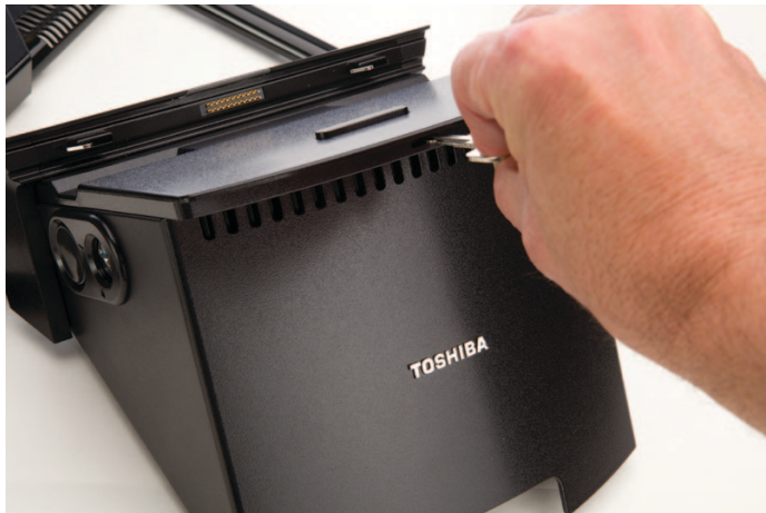
■ Shown: Back cover removal

All cable connections are secured behind a unique back panel. The panel cannot be removed unless the mobile unit is unlocked, and undocked.