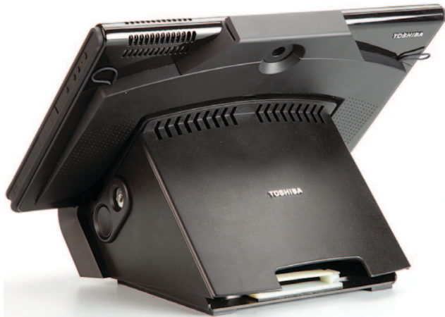
■ Shown: Back view of TCxFlight with Base Feature and Integrated MSR

The TCxFlight enables traditional or mobile solutions for today's retailers with the power and performance packaged in a rugged design. All of the logic is contained in the mobile unit.