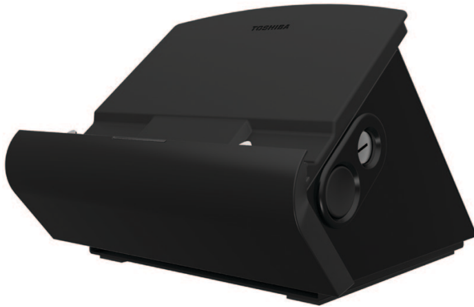
■ Shown: Base only (front)

Optional base unit can be configured with one or several mobile units in order to accommodate a variety of store layouts. The connector is designed for years of use in the rugged retail environment, which includes docking and undocking with any available base throughout the day.